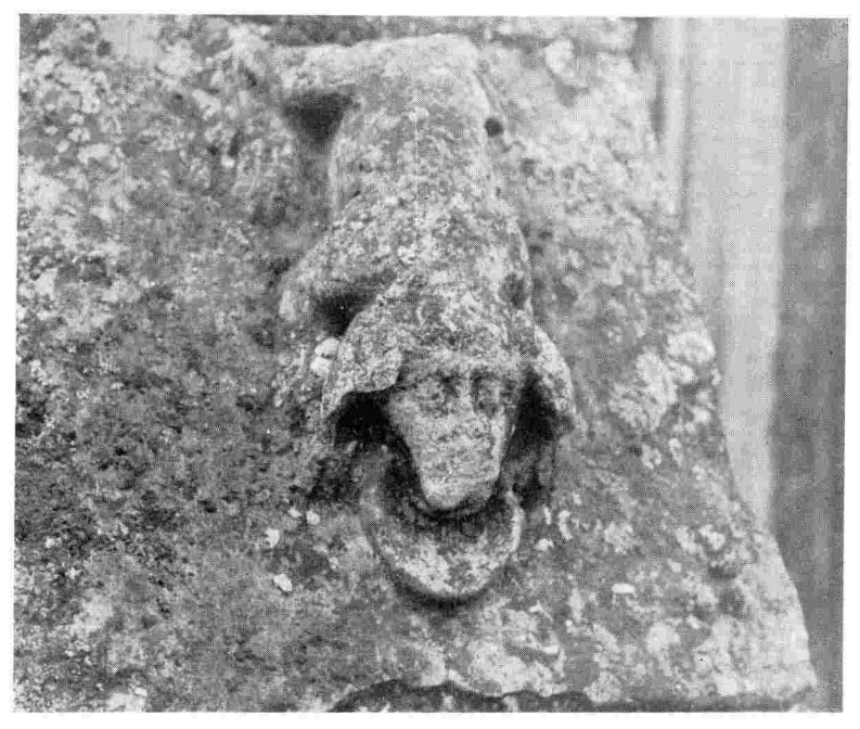
a, Carving on Porch of Badingham Church.