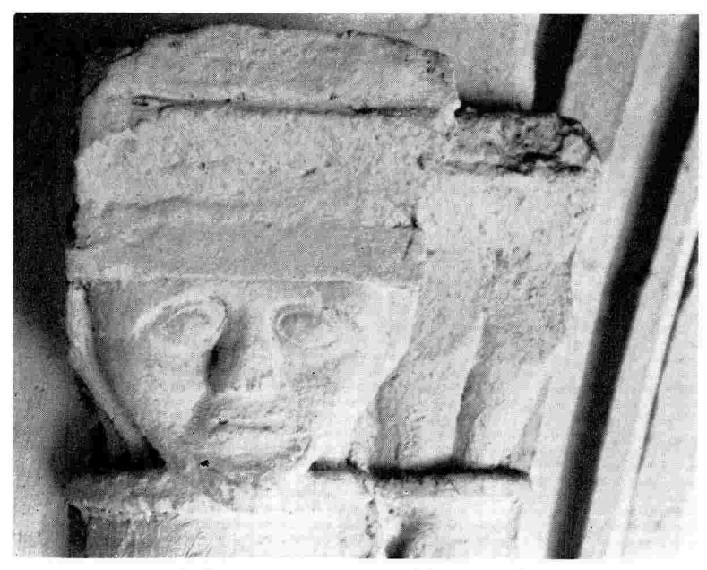
b, Carving on a capital in Orford Church.